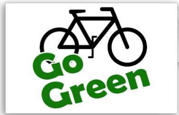
Green Initiative Reduce CO2 Footprint