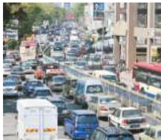
Reduce George Town Traffic Jams