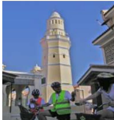
Masjid Melayu Lebuh Aceh (Est.1808)