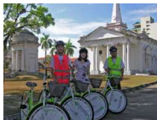
Multi-racial Religions & Cultural Exchange