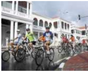
Promote Healthy Cycling Lifestyle