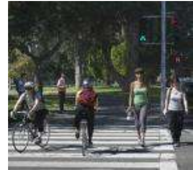
Safety Pedestrian Crossover