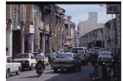
Reduce George Town Car Park Problems