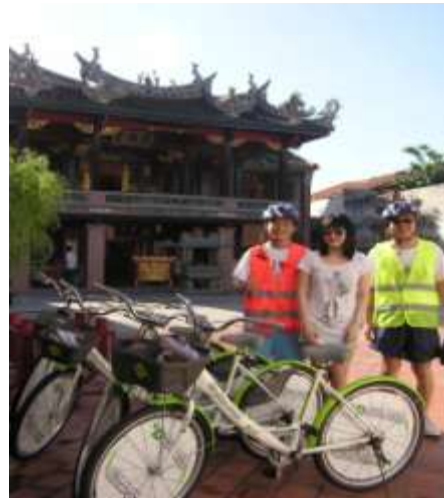
Hock Teik Cheng Sin Temple (Est.1884)