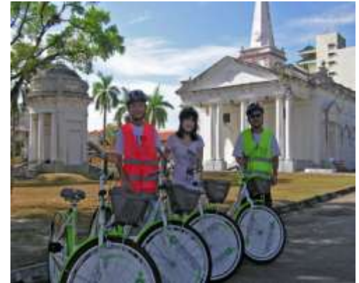
St. George's Church ( Est.1818)