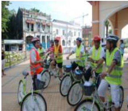
Tg. City Marina (Beside Jetty Bus Terminal) Start Point