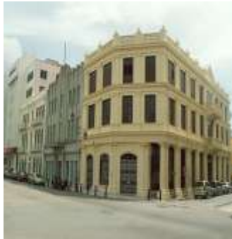
Weekend Morning (less traffic)