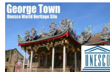
Promote Heritage Conservations