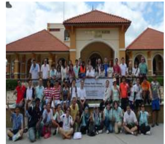
Corporate Teambuilding Group Photo