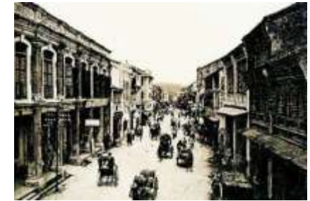
Guided Tour to Discover George Town Historical Evolutions