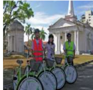
Small Group Guided Cycling