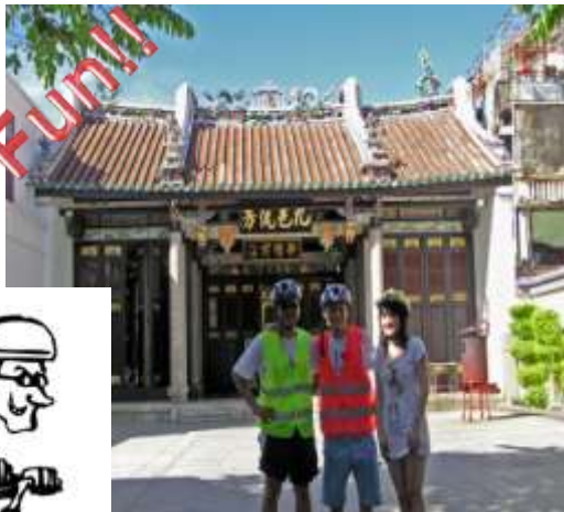
UNESCO Award Hock Teik Cheng Temple ( Est.1870)