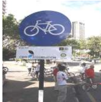
Safely Guided Bicycle Trails