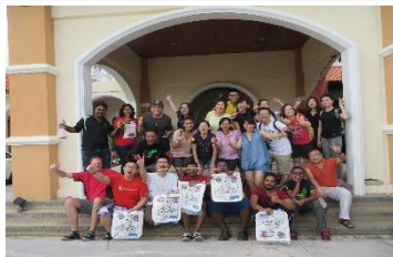
Motorola Solutions 25/1/2017