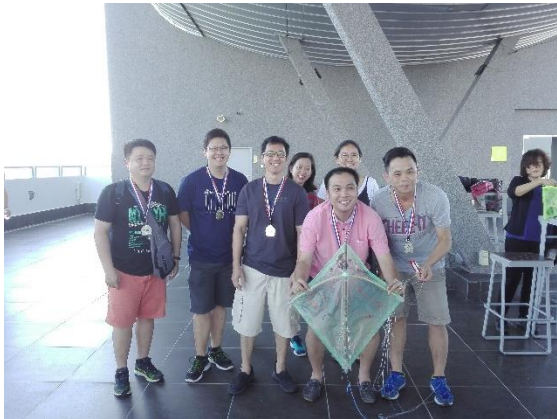
Kite Making Experience