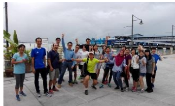
Flex Global Supply 13/10/2017