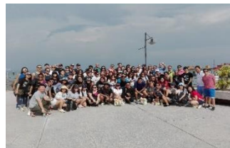
The Walt Disney SEA 25/7/2018