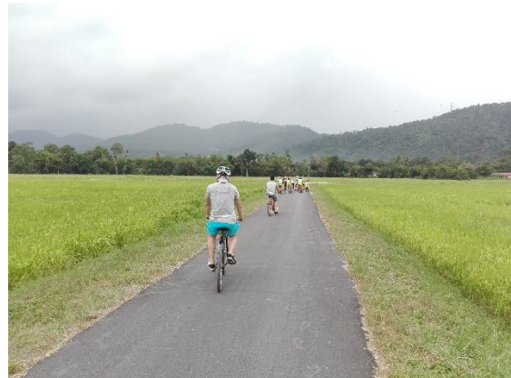
Country Side Cycling