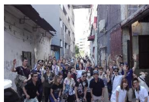
Bandai Namco SEA 25/5/2018