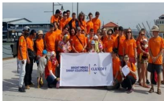
Luxoft Penang 6/7/2018