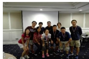
Intel Q&R 9/7/2018