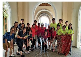
DELL Finance PG 23/11/2018