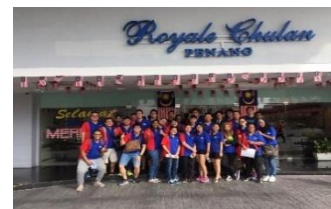
NSW Automation Penang 8/9/2018