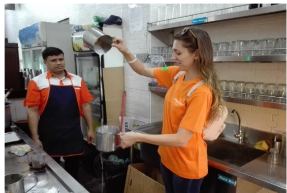
“Teh Tarik” Preparation

George Town Unesco Heritage Site Activities: