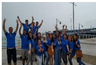
Elanco International 26/9/2018