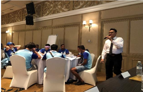
Indoor Training Workshop