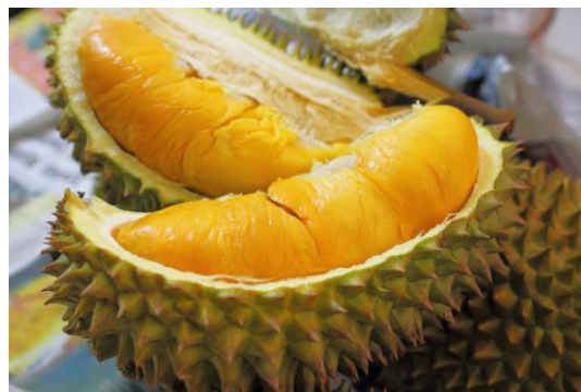
Balik Pulau Durian

The outdoor training session allows closer participation amongst team members. It also helps to develop team building spirit amongst employees, team work, foster and build better working employees relationships.