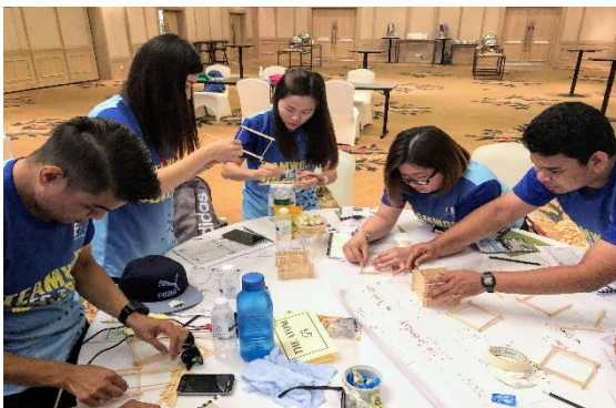
Team Work Development