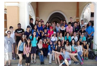
Intel Global Supply Group 18/7/2017