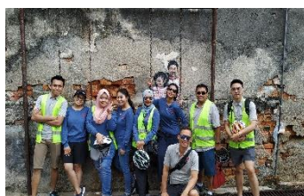
SC Johnson SEA 9/11/2018