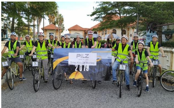
Heritage Site Cycling