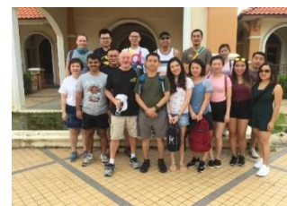
HDI Global SG 13/10/2018