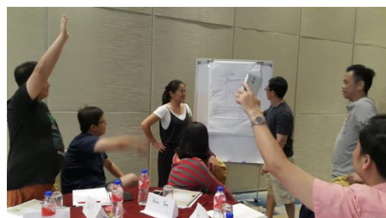
Solving Team Conflicts