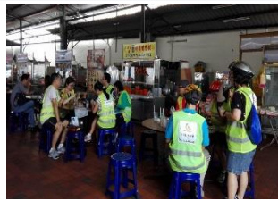
Intel IE Group 29/5/2017