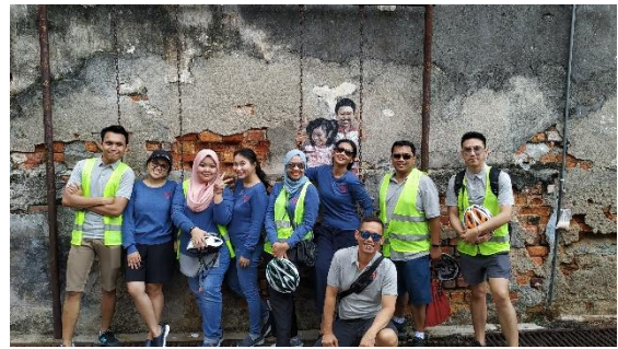
Street Arts Hunt