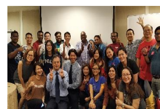
Intel CLPG 5/12/2018