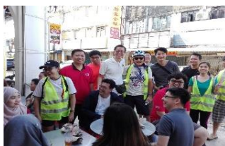
Intel IOT 19/3/2018