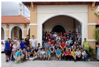
Intel PSG Group 9/10/2017