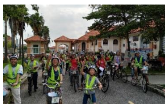
Charterway Integrated BM 22/9/2018