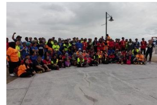
Northern Corridor Implementation Authority (NCIA) -30/11/2017