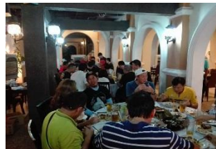
Japan Matsui Group 23/11/2017