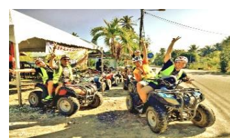
Xcerra Multitest 30/6/2018