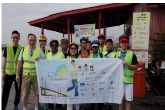
Penang PCET 15/1/2017