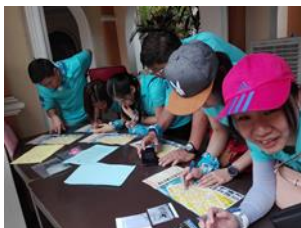
Ferring Pharmaceuticals. 12/1/2018