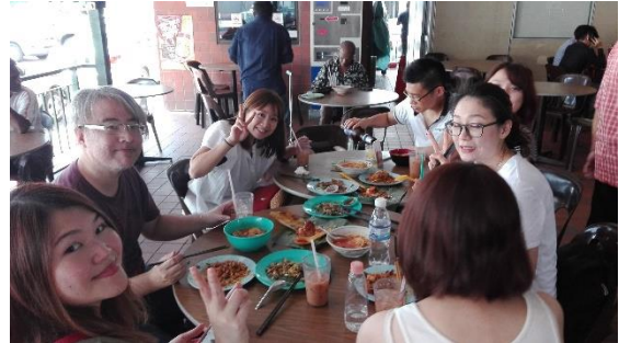
Street Food Hunt