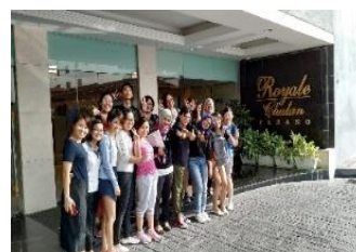
National Instruments APAC 11/10/2018