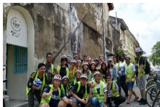
MCSB Penang 13/10/2018