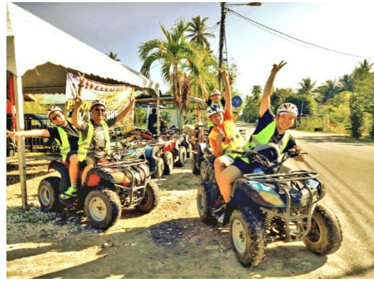
ATV Riding Experience