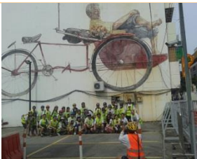
Plexus PG 16/6/2013