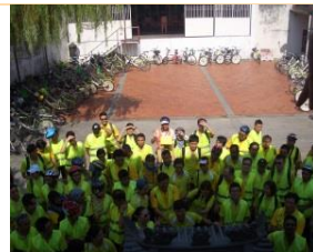
Motorola PG 31/10/2013