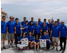
Pfizer Inter. 9/11/2016