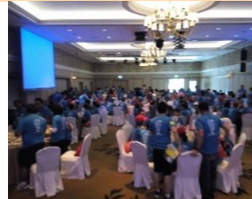
Khazanah Nasional 18/10/2016