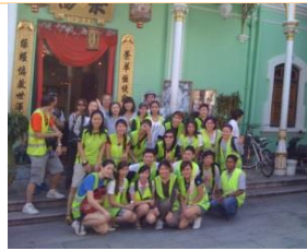
AMD PG 16/3/2012