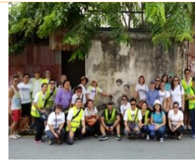
Hershey SEA 23/4/2015