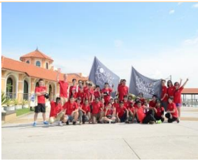
Four Points Hotel 1/11/2014