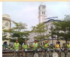
Fullerton SG 8/9/2012