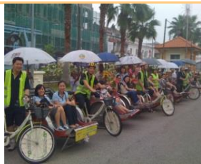
UOB Kelawei 30/6/2012