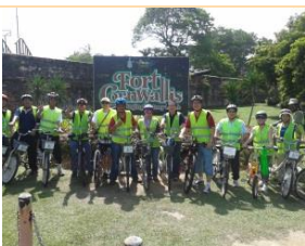
First Solar Kulim 13/12/2013