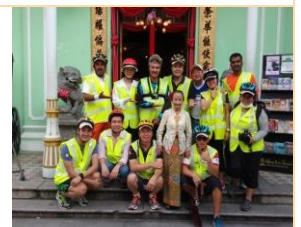
Bromma Ipoh 13/10/2014