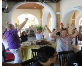
KFC ASIA 8/9/2016