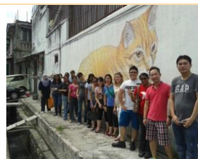
National Instru. 12/5/2014