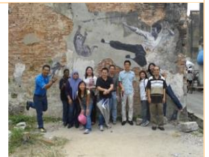
Avago Asia 26/9/2013