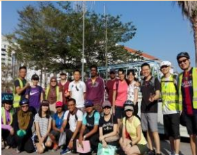
Intel PG 04/3/2016