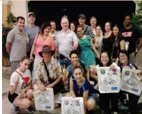
Flextronic Interna. 18/5/2016