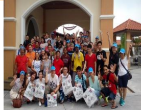
JTI SEA 24/10/2015