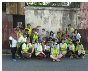
Continental Tire 23/2/2014