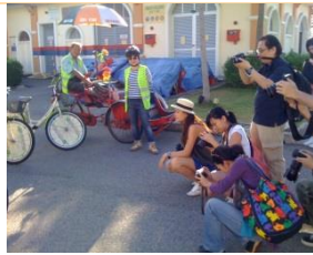
HK Media Group 5/1/2012