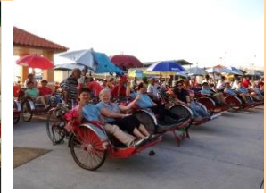
APPLE APAC 22/1/2016