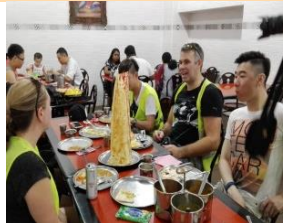
IPinGlobal SG 20/3/2016