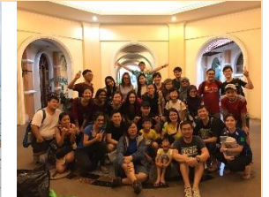
Handshake Tec SG 18/11/2016