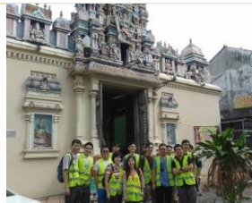
Altera PG 19/8/2013