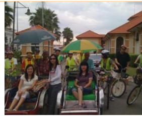
Jabil PG 19/4/2012