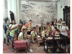
Panasonic Kulim 3/4/2013