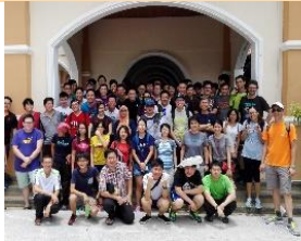
Motorola Solutions 21/9/2016