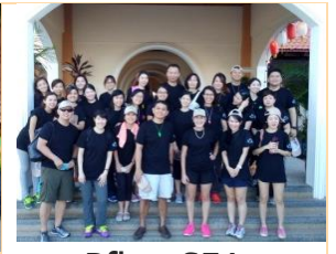
Pfizer SEA 12/5/2015