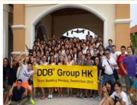
DDB Group HK 18/9/2015