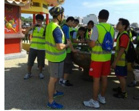
Intel PG 1/3/2013