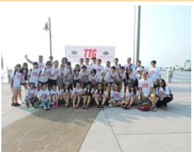
TTG ASIA 4/7/2016