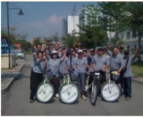
Eastin Hotel 29/10/2010