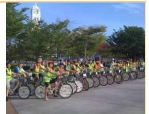
KPMG SG 30/9/2012