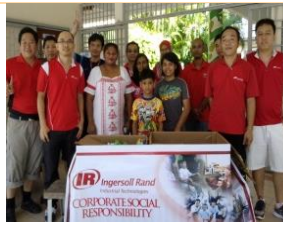
Ingersoll Rand 29/11/2014