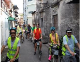
First Solar US 12/6/2015