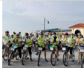
CWM Group 14/5/2016