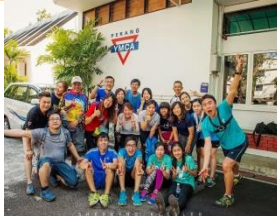
YMCA HK 7/1/2016