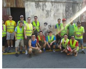
First Solar US 16/2/2013