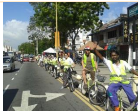
PTS Properties 29/6/2013