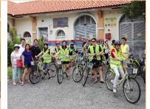
Crowe Howath SG 3/10/2016