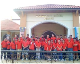
Coca-Cola Msia 17/10/2012