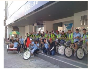
UOB PG HQ 12/5/2012