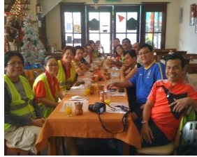
Monsanto SG 14/12/2012