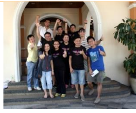
Samsung PG 14/12/2014