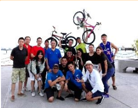
Elanco Int. 11/10/2016