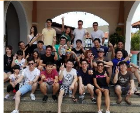
KPMG SG 5/11/2016