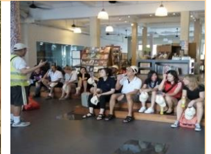
BOSCH APAC 8/6/2016