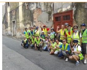
Intel PG 3/3/2014