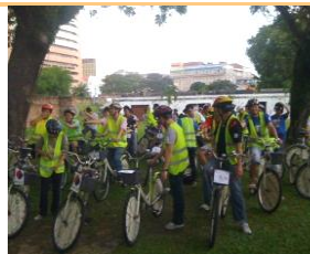
Great Eastern Insurance 8/9/2012