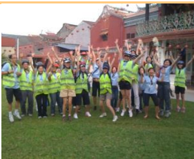
UOB BM 19/6/2012